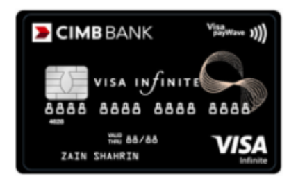
CIMB Visa Infinite (Min Income : RM 150,000 per annum)